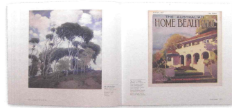
Copy Right's Laguna Encalypsus, Bruce Mason by Holly Sanders for The Australian Home Beautiful.

"Californians used photographs to express the conquest of nature and 'manifest destiny', while Australians used them to express the imposition of British law and civilization on a wild and untamed place."